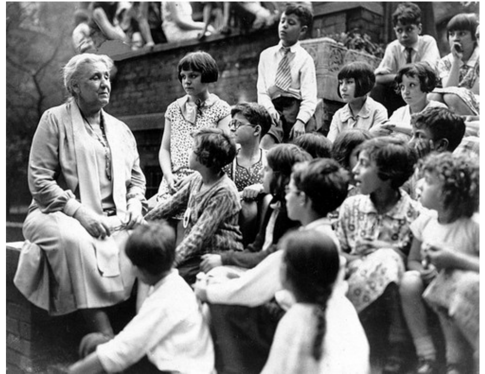
Jane Adams, Hull House Founder